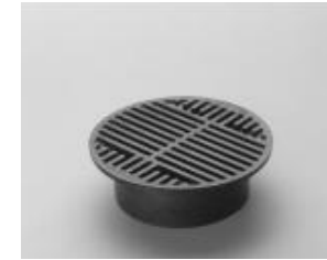
8 inch NDS green/ black grate