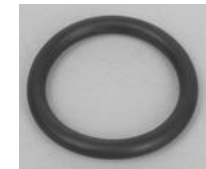
O-ring 1 1/4x 1x 1/8