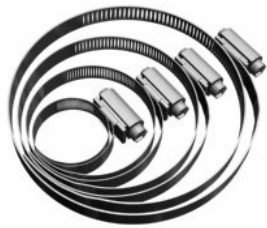
6 – 7 inch metal hose clamp