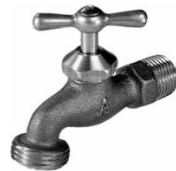
Brass Sillcock/ Hose Bibb 3/4inch MPT