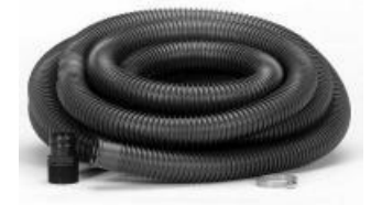
8 foot section of 1 1/4 inch sump pump hose