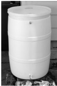
30 or 55 gallon plastic barrel