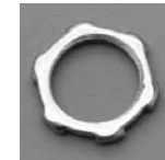
3/4 inch lock nut