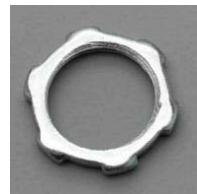
1 1/4 inch lock nut